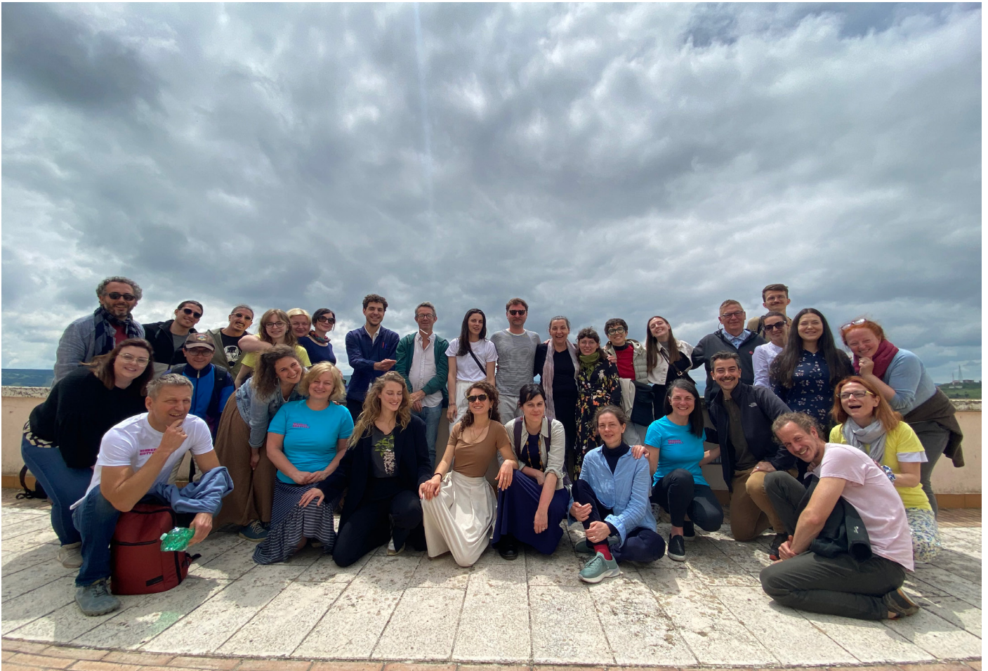
A group picture of the partners of the project taken during the European Training held in Grottole (Italy), May 2023