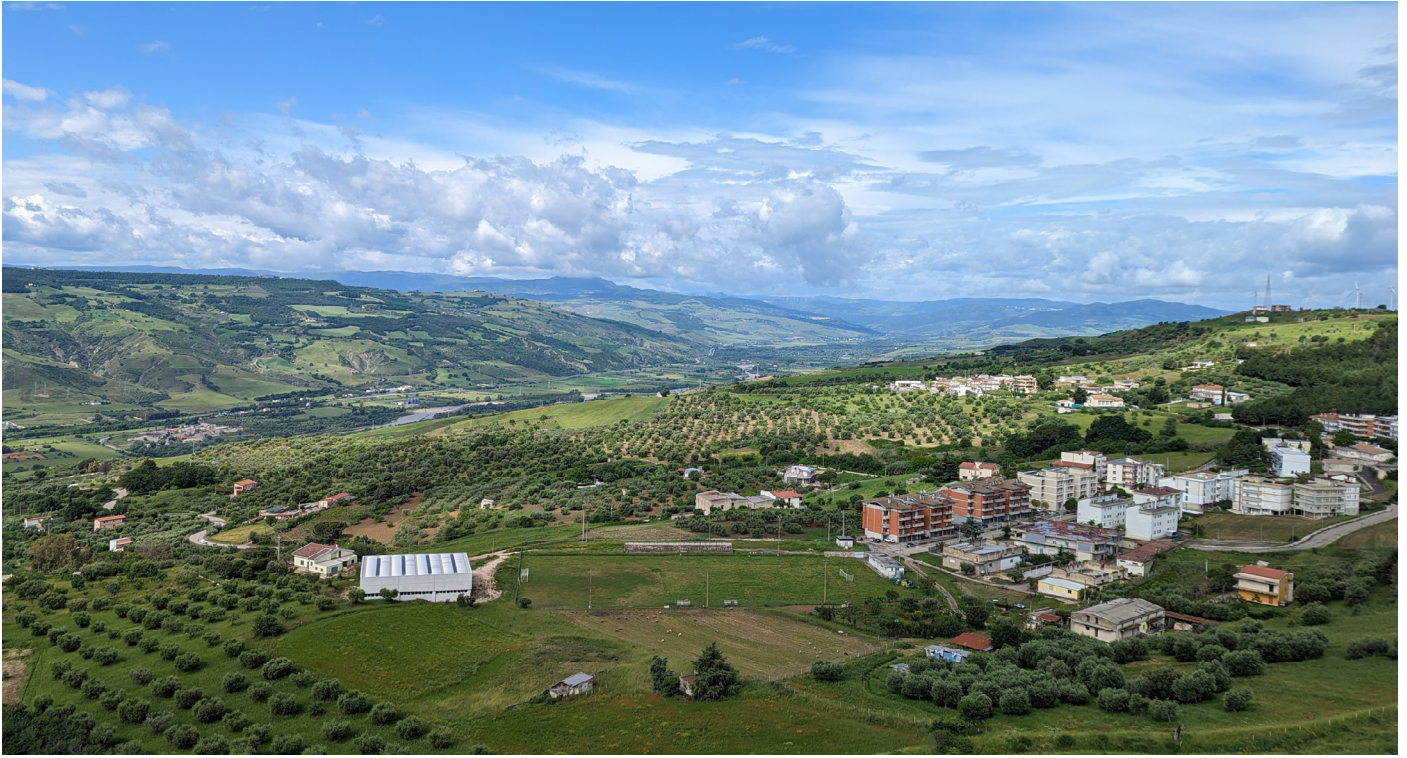
Panoramic view from the historic centre of Grottole Village in Italy