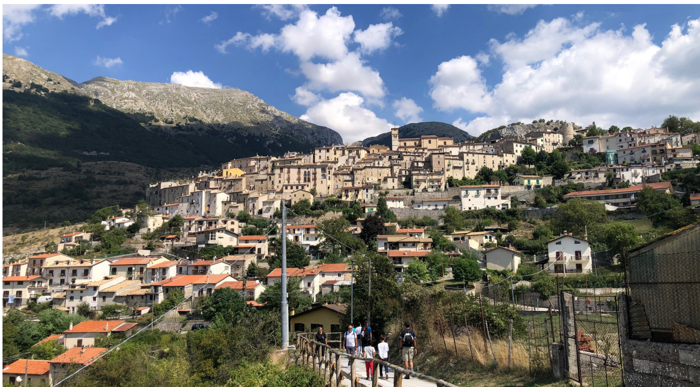
Barrea, Italian village in the Region of Abruzzo