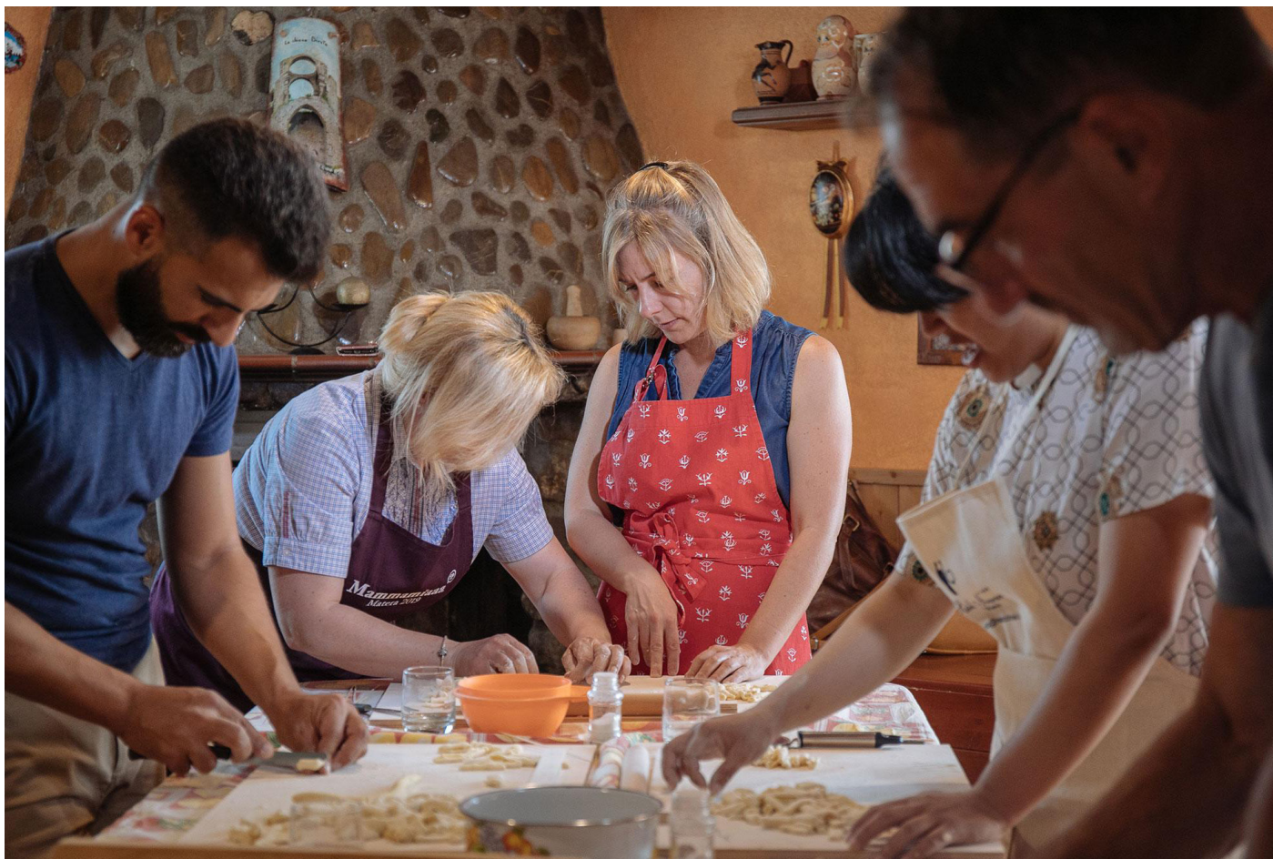
Cooking class in Grottole, Italy