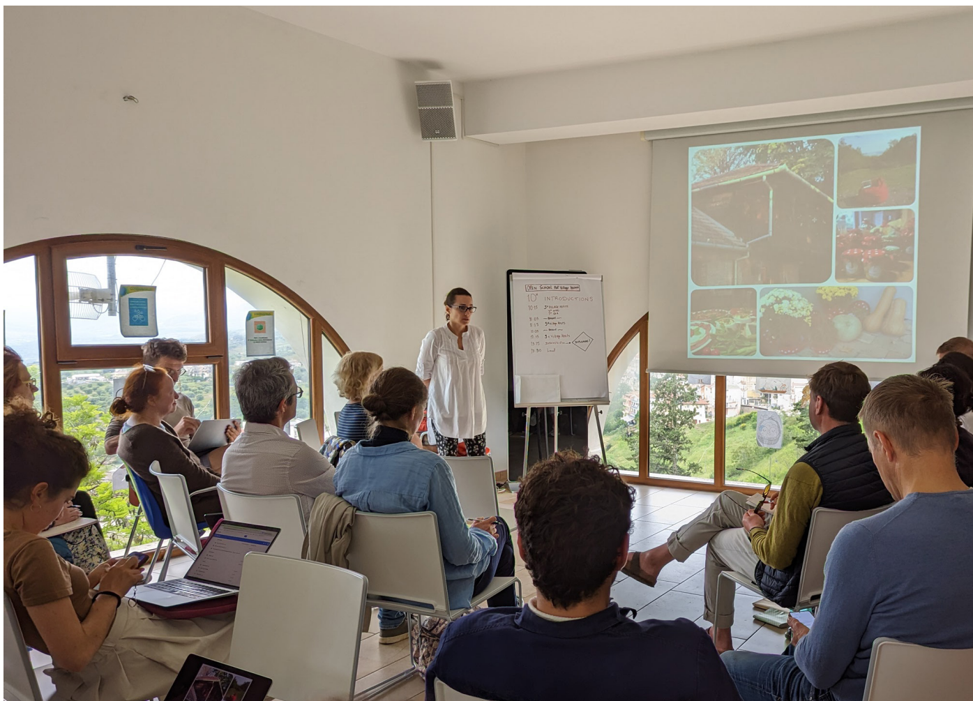
Some of the participants to the European Village Hosts Training, held in May 2023, while they present their projects

Village Hosts especially make it possible for diverse partners and stakeholders to work together – often for the first time. This connecting work demands special skills: hosting, convening, facilitating, animating, and coordinating.