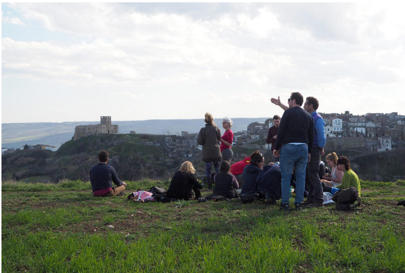
People on a field visit to one of the Villages involved in Open School for Village Hosts