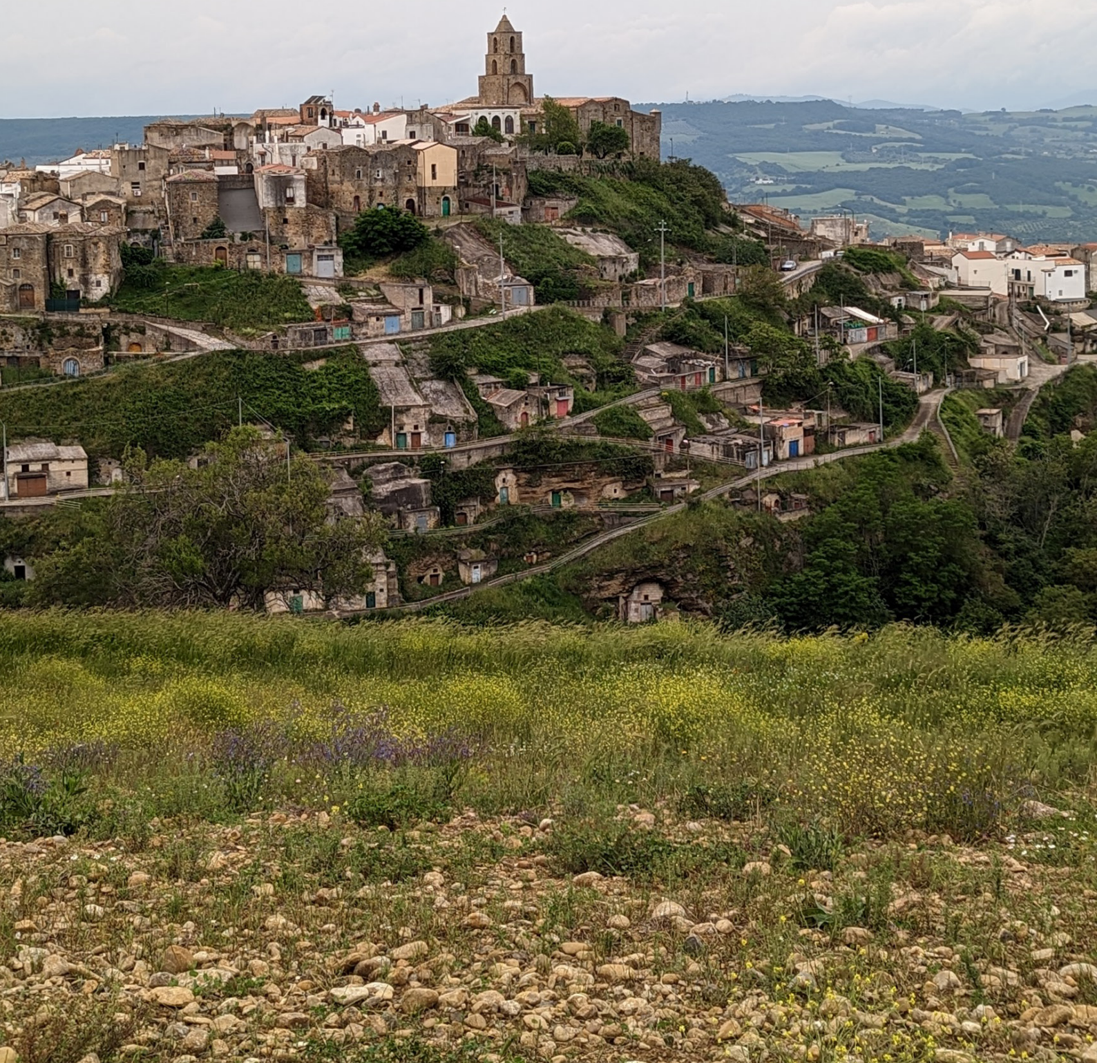
Picture of Grottole (Italy) seen from the other side of the canyon. The photo was taken during the European Training held in this Italian village in May 2023.